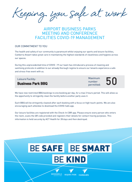
Terms of use and capacity signage